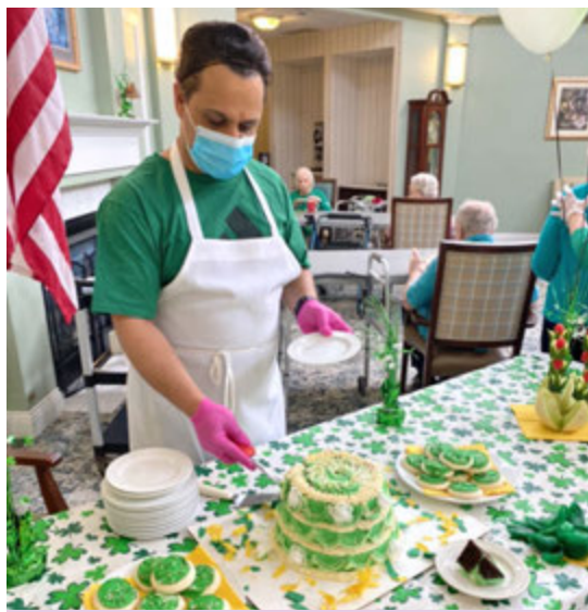
Abdullah St. Patrick's Day Celebration