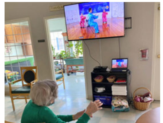
Tai Chi Exercise Class