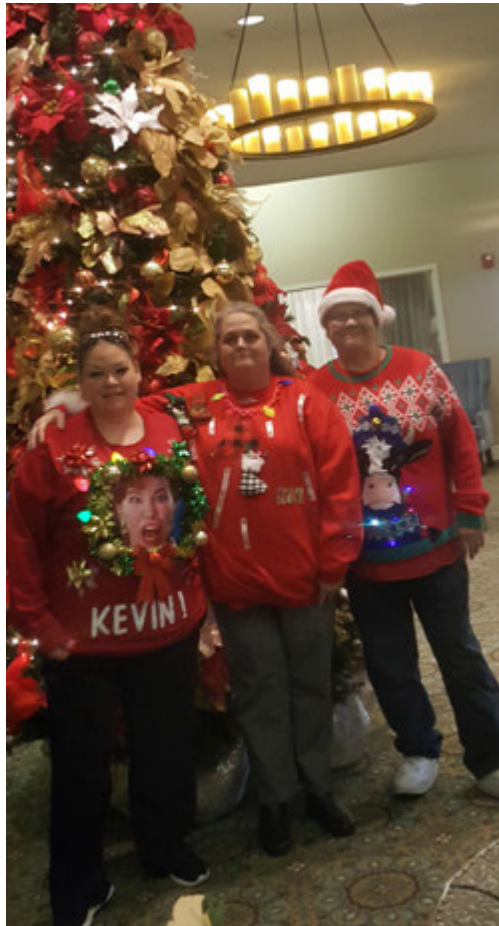
It will be nice to get back to this!