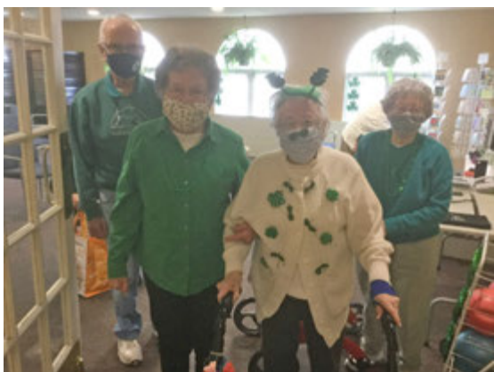
Everybody is a little Irish on St. Patrick's Day!