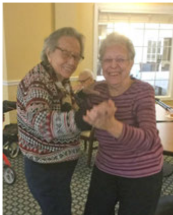
Residents are up on their feet for Happy Hour with entertainment back in the building!