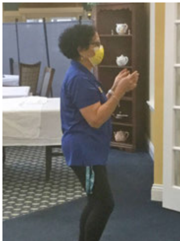
Lucy is at it again now that we have live music at Happy Hour!