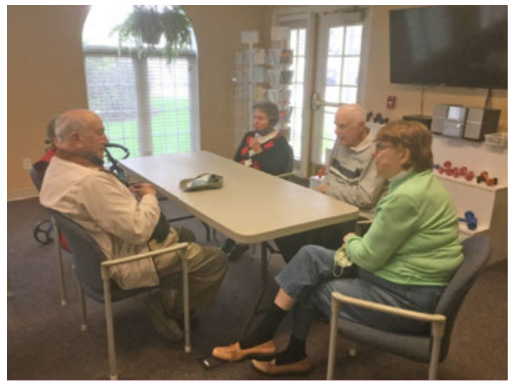
Sundae Sundays are back!

This month for our Better Together theme, we will be celebrating the Ages of May in honor of Older Americans Month. We will of course be embracing the big holidays — Mother's Day, Cinco de Mayo, Armed Forces Day and Memorial Day. But we will also be recognizing events such as Teacher Appreciation Day and the Kentucky Derby, icons such as Bob Hope, Liberace and John Wayne, and "institutions" such as Hershey's and Ben & Jerry's. As the Covid-19 restrictions ease, we've been able to restore bi-weekly restaurant outings, all of your favorite card games and front porch activities to the calendar. We have also introduced the warm weather ice cream favorites of Root Beer Floats and Sunday Sundaes. Enjoy the month of May!